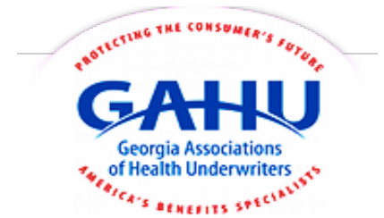
PAC Giving 2013 - 2014 Cycle